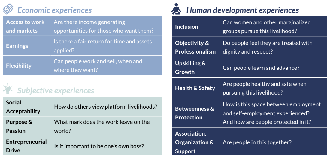
FIGURE 2 Elements of Platform Livelihood Experiences

Notes: Version 1.0 October 2020. These types come from an analysis of 75+ studies of platform livelihood experiences in the global South http://platformlivelihoods.com . This figure was developed by Caribou Digital and Qhala, with the support of the Mastercard Foundation.