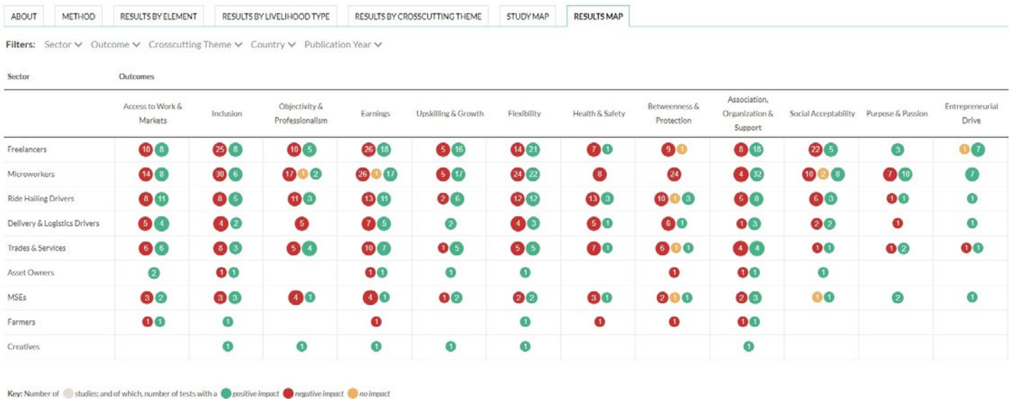
FIGURE 3 Screen shot (15 October 2020) of online evidence map.

The best way—the best level of analysis—at which to assess and understand the quality of platform livelihood experiences in the Global South is to apply the 12 experience elements to one livelihood type at a time, ideally filtering by country, or by other factors such as gender or reality that one might want to address. Such specificity avoids the overgeneralization that predominates popular discussions of the gig economy or the future of work. Of course, this type of analysis is impossible to represent systematically and comprehensively in a paper document. But, we have made available an accompanying online resource 2 searchable and filterable in these ways. We encourage this document to be read as a companion to the evidence map, and hope that individual researchers can follow the links back to the original studies and engage directly with the researchers around the world.